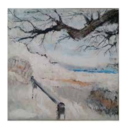
A MOMENT OF REFLECTION IV, Acrylic, graphic

In 2009 she held an exhibition of photographs and graphics at the 71st World Independent Film Festival "Unica" in Gdansk. In March 2010, she participated in an international exhibition in Rome "I colori della Polognia a Roma". Her work can also be seen in the gallery "Sztukarnia" in Warsaw.