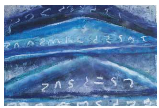
PYRAMID 1, Acrylic