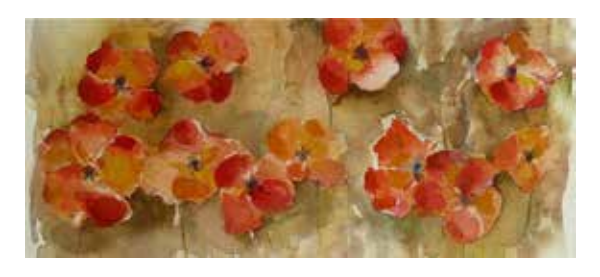
POPPIES, Watercolour 34X15

RUMMAGE, Watercolour 34x15 EUCALYPTUS, Watercolour 34x15 AUTUMN, Watercolour 34x15