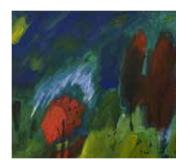
UNTITLED II, Acrylic on canvas

She has participated in a number of group exhibitions over the years and is interested in contemporary abstract art and the paranormal.