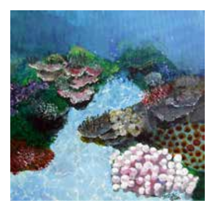
OCEAN FLOOR 2, Acrylic on canvas

OCEAN FLOOR, Acrylic on canvas OCEAN FLOOR 3, Acrylic on canvas