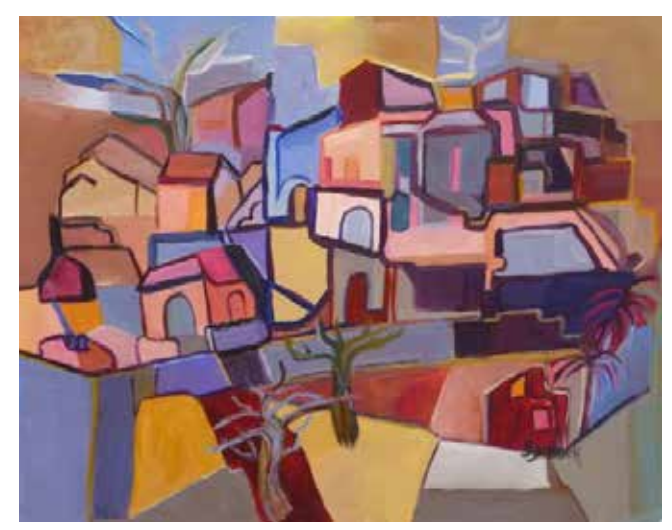
MEMORIES OF MAYORCA, Acrylic on paper

CIRCUS III mixed media CIRCUS IV mixed media CIRCUS V mixed media CIRCUS IX mixed media