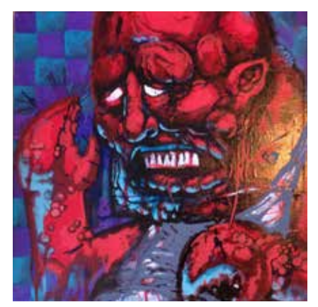
PTERODACTYL, Mixed media