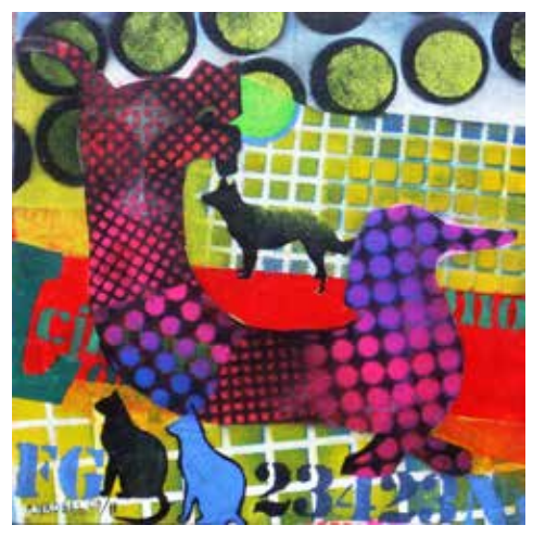
CIRCUS II mixed media

Berween 1975-81 he participated in "Mail Art" exhibitions in Europe, America and Australia and group shows of paintings, prints and drawings in Poland. He arrived in Australia in 1982 and continues to exhibit in various group shows.