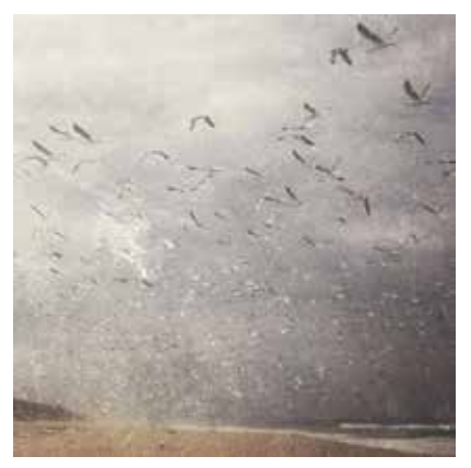
BIRDS, C-Type Archival Photographic Print