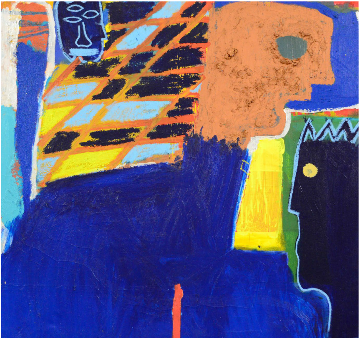
KING IS IN THE MIRROR Acrylic, oil paint stick and oil paint on canvas 92x87cm

I can't express how much the Polish Art Foundation helped me with the promotion of my art. Whilst going through a very difficult and long Covid19 lockdown, I was selected to present my paintings during an online exhibition in 2021 - 'Oblicza Polonii: Faces of Polish Community'. It was a very special experience, that gave me a creative outlet and allowed me to forget about the pandemic and focus on my art. In 2022, I was delighted to be selected for a new group exhibition called 'Borders/Granice'. The exhibition was located at the historical Victorian Artist Society Gallery and I was very honoured to have my work on show, along with the many other talented artists on exhibit. I was also provided with the unique opportunity to do a short poetry reading of my own work on the night of Meet the Artists. I would like to thank, once again, the Polish Art Foundation for being so supportive of me and my art practice.