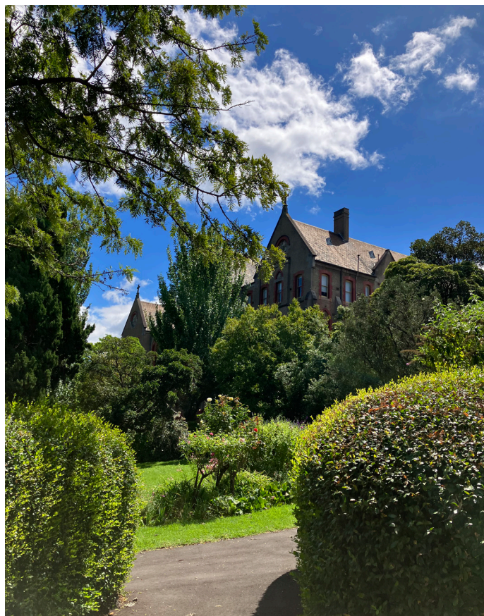
PAF Art Meet event held in March earlier this year.