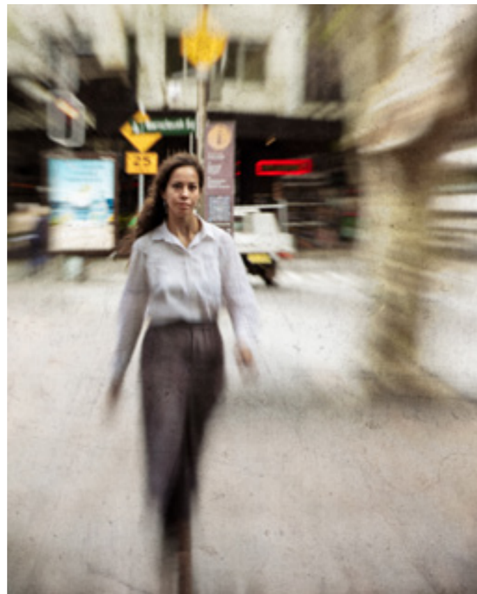
The way she walks