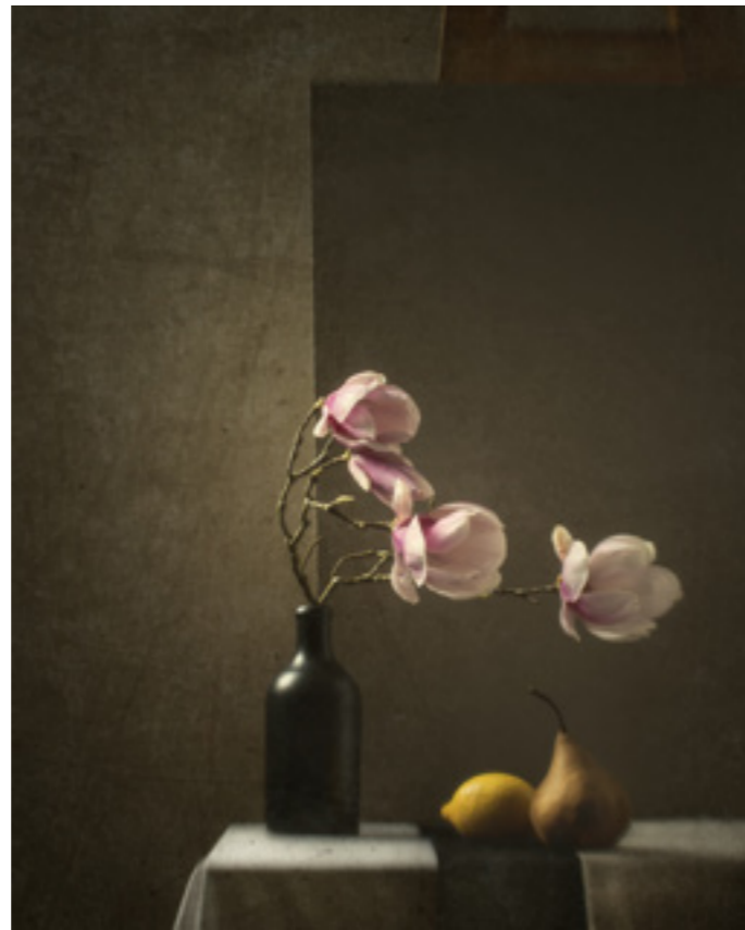
The last one standing

People. As I said before, there is no meaning to this life without us - people.