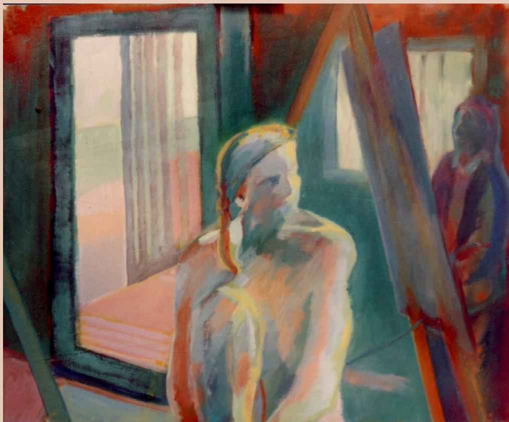
Janine Good 'Studio Model' 1987, Oil on canvas 60x475cm