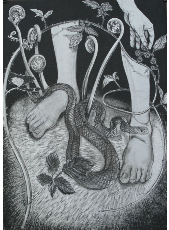
Janine Good 'Ripe For Picking', Charcoal on grey Ingres Paper 80x57cm

More recently I completed a Foundations of Art Therapy ACA Accredited Certificate Course because I am interested in how art practice can be beneficial to human well-being.