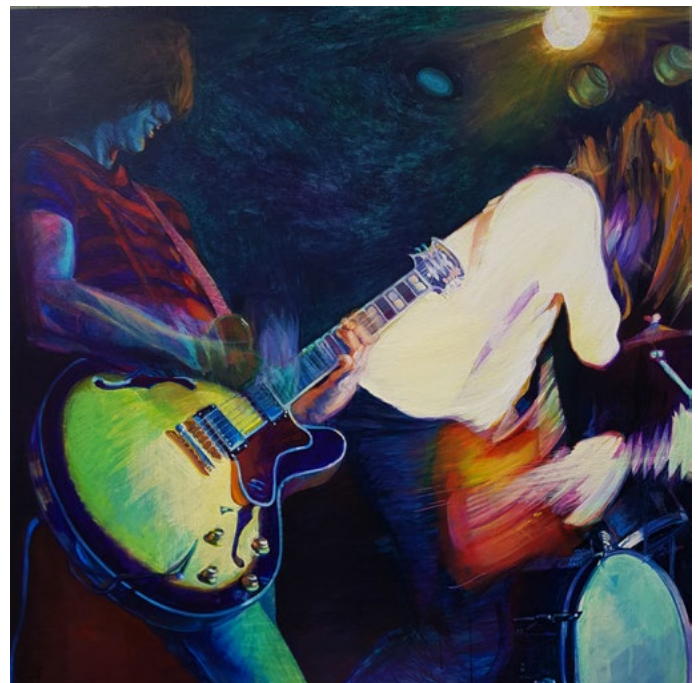
Janine Good 'A Day in the Life of Damien' 2019 Oil on canvas 102x102cm