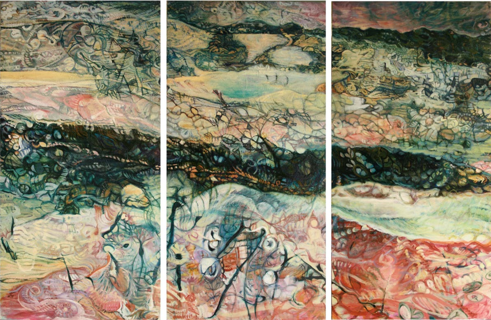
Janine Good 'Seeking Nectar' Triptych, Oil on canvas 120x180cm