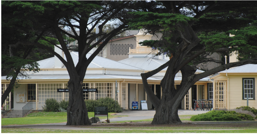
The Quarantine Station became part of the Point Nepean National Park in 2009.