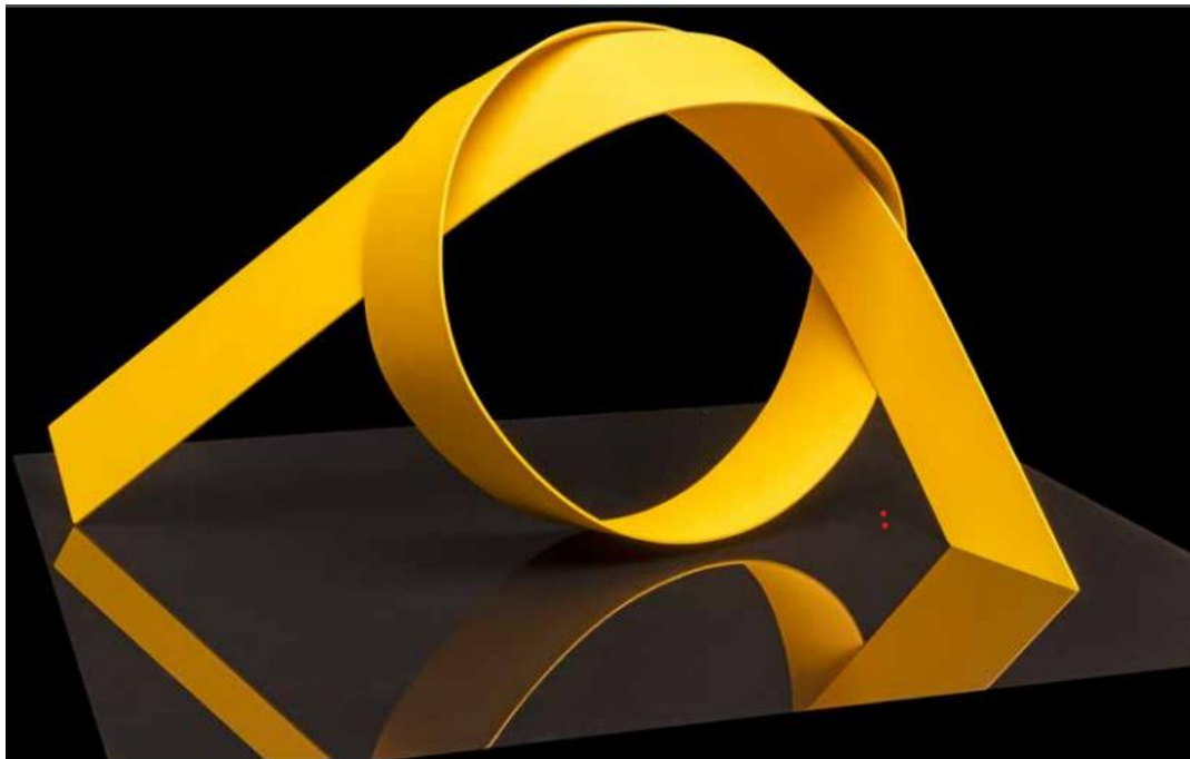
ROMAN LIEBACH Looking for More in The Ordinary 8cm wide strip of aluminium, painted Base: 71 x 59cm acrylic perspex

A simple, familiar form of a knot, made using common techniques of cutting and bending, intended to appear as an unpretentious, inspiring the minds sculptural object.